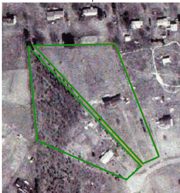
The outlined areas are two different properties. The owner of the land on the left has planted trees, encouraged wildlife habitat, and maintained a walking trail through the woods. The property on the right is mostly lawn which requires regular maintenance and provides little benefit to wildlife and surrounding woodland.

The manual is made up of five parts that include a series of lessons, activities, and relevant information. It presents a step-by-step process for creating a personalized management and action plan. The lessons include detailing objectives, drawing a map, conducting an inventory, planning activities, and converting lawns to forest.