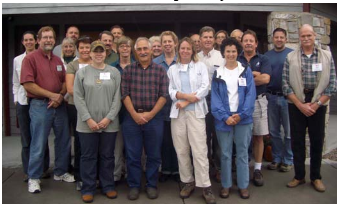
Class of 2006 Coverts Cooperators

Research has shown that landowners oftentimes implement wildlife or forest management practices, or con-